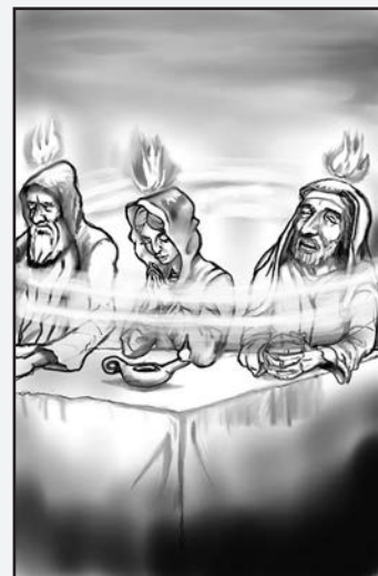
The gifts Jesus gave His church are gifts from the Holy Spirit.

What comfort do you get from Ephesians 4:7–10? How do these verses show you what Jesus did for us?