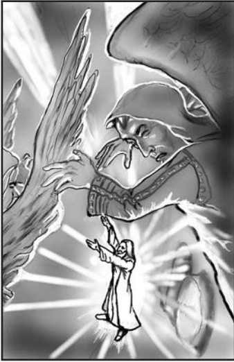
Jesus won the war against Satan and his evil angels (read Colossians 2:15).

ADDITIONAL THOUGHT: The two comments below will help us better understand Ephesians 4:7–10: