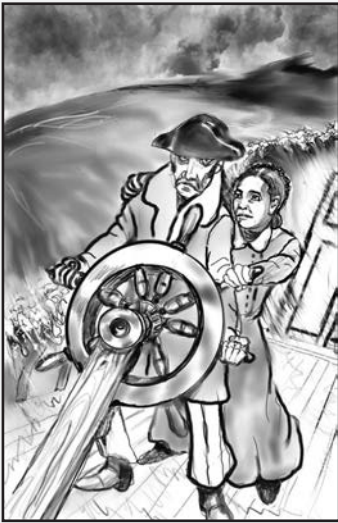
The ship captain must obey the pilot.

Paul uses Psalm 68:18 to show us that Jesus gives gifts to His people after He wakes up from the dead and goes to heaven. What gifts does Jesus give and why does He give them? Read Ephesians 4:11–13 for the answers.