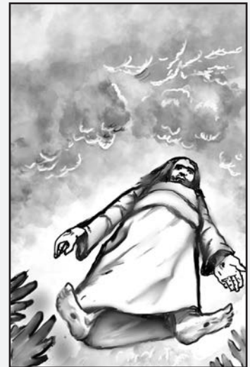
Jesus woke up from the dead. He went to heaven.

What is the connection between God’s work as Judge and the Good News that continues forever in the 1st Angel’s Message? Why is the Good News an important part of God’s work as Judge of the whole earth?