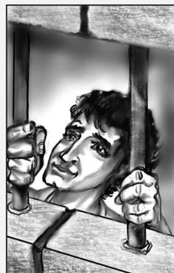
God gave Joseph a test to remove any doubt from his heart about His promise.

"God expects His children to obey His law right away and without question. But people are asleep. Satan's lies keep them from doing what is right. Satan gives them excuses not to keep God's law. Satan lies and causes people to do what they know is wrong. Satan uses the same lie he used with Eve in the Garden of Eden. 'You will not die' [Genesis 3:4, ERV]. When we disobey God, we harden our hearts. We cause other people to sin, too. At first, our sin looks very bad to them. But after a while, our sin stops looking so evil in their eyes because they get used to the sin. They question if the sin is really sin at all. Then they start doing the same sin."—Ellen G. White, Testimonies for the Church , volume 4, page 146, adapted.