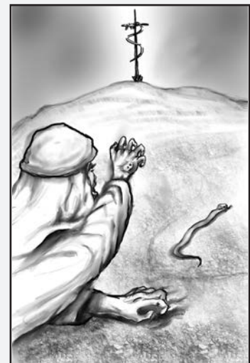
The brass snake was a substitute for the Israelites in the desert who were dying from snake bites.

Jesus came to show the Father to us (John 1:18). When we see Jesus’ love, we also see who the Father is.