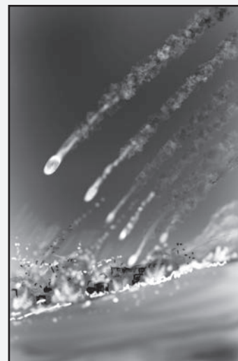
The story about Sodom and Gomorrah is a warning to the people living in the end times.

We must remember that the Bible, for the most part, is written to God's own people, and not to people who don't believe in the Lord. When we read about the awful sins of the people in Revelation 13 and 17, we should see these sins as a warning. We must be careful. Or we can fall into the same trap of sin.