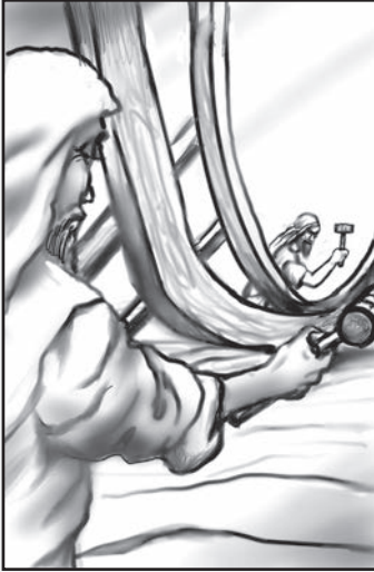
Noah “built a large boat to save his family.”

Peter tells us that many people won't be ready for the Second Coming because they “don't want to remember what happened long ago” (2 Peter 3:5, ERV) at the Flood. History shows us that many different people in the past believed in a worldwide flood. Both the Greeks during Bible times and the Mayans have a flood story. Today, many people make fun of the story about Noah and the Flood. The Bible says people in the end times will reject the Bible truth about the Flood.