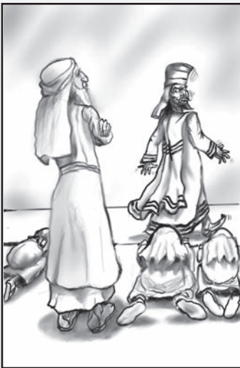
Haman notices that Mordecai won’t bow down and worship him.

Haman notices that Mordecai won’t bow down and worship him. Then Haman gets angry (Esther 3:5, 6). He tries to destroy all of Mordecai’s people, the Jews, on the earth.